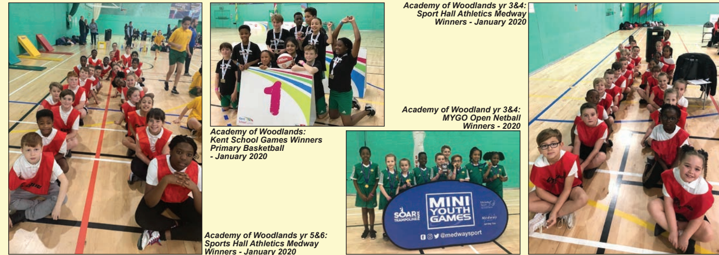
Academy of Woodlands yr 3&4: Sport Hall Athletics Medway Winners - January 2020