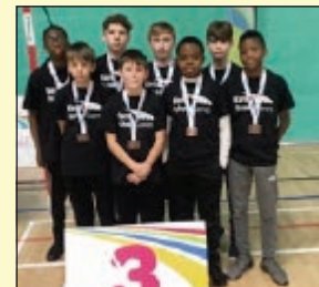
Boys U13 Handball Kent School Games final 3rd place team - Feb 2020