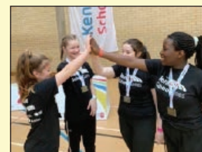
Girls yr 7 Kent School Games Indoor Rowing final 1st place team - Feb 2020