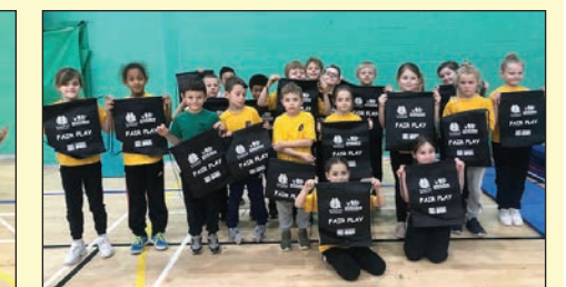
Elaine Primary Fair Play Winners yrs 3 and 4 Sports Hall Athletics - 30th January 2020

The HSSP staff and Greenacre sport leaders helped to organise the yrs 3&4 Festival of Indoor Athletics events at Medway Park with many spectators in attendance. Many congratulations to the Fair Play winning team in the morning session: Elaine Primary Academy. The final results were as follows: