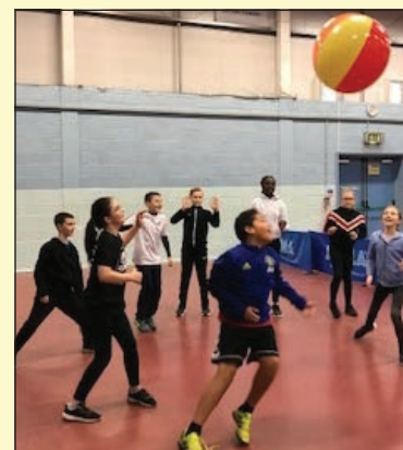
Beach Ball training for Sports Crew - 5th December 2019