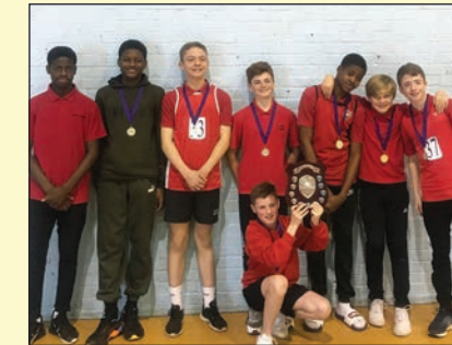
Rainham Mark Grammar Boys 1st place Sports Hall Athletics - 16th January 2020