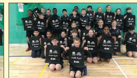
Bryony School Fair Play Winners yrs 5 and 6 Sport Hall Athletics - 23rd January 2020