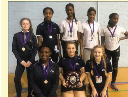
Chatham Grammar Girls 1st place Sports Hall Athletics - 16th January 2020

The highest placed school teams from both the HSSP and GSP areas then represented Medway in the Kent School Games finals.