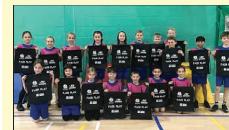
Fairview Primary Fair Play Winners yrs 5 and 6 Sports Hall Athletics - 23rd January 2020

The morning session Fair Play Award was won by Fairview Primary and the afternoon sessions Fair Play Award was won by Bryony School. We congratulate the Fair Play Award winners and well done to those teams that qualified for the Kent School Games finals. We do emphasise the importance of Fair Play, Respect, Resilience and Team-Work and are always keen for teams to receive the Fair Play Award/the Endeavour Award at all of our Festivals.