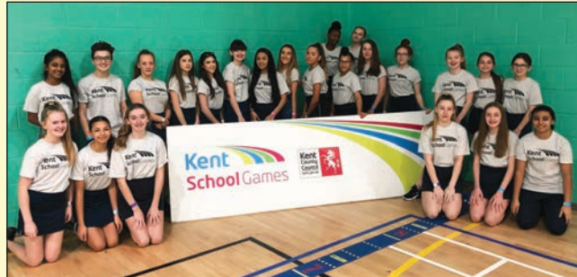
Rainham School for Girls Sports Team Leaders at the Kent School Games

Having run leadership sessions for several years, I often meet children who have taken part in one of these courses and it is something that they remember fondly. Of course, leadership doesn't stop at primary school.